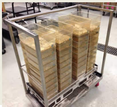
Figure 3– TT36 Stainless Carts