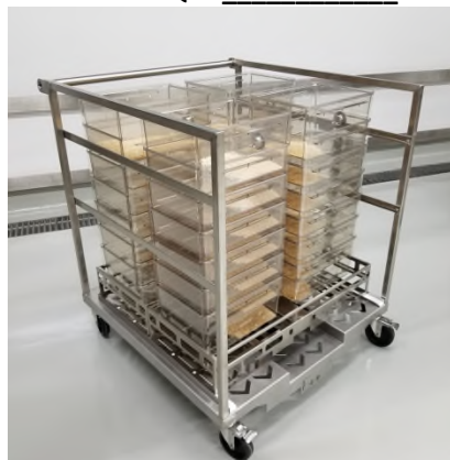
Figure 4– DT36 Stainless Carts